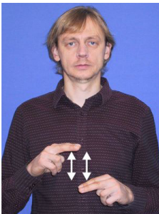
Būves pamati (2)