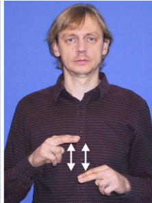
Būves pamati (1)